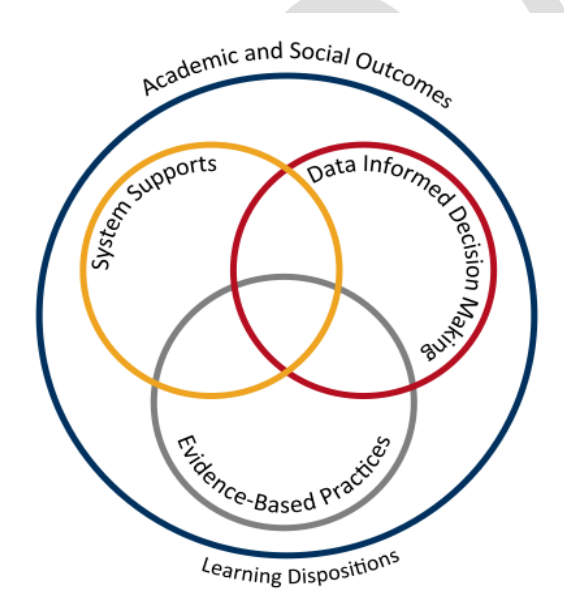
Diagram 1: Adapted from School-wide Positive Behaviour Support: implementers' blueprint and Self- Assessment, by OSEP Centre On Positive Behavioural Interventions and Supports, 2004, Eugene OR: Lewis

PB4L is a framework (Diagram 1) for schools that use a system approach to positive behaviour supports for all students. The aim of implementing the framework is to achieve increased academic and social progress and achievement for all students by using evidence-based practices. One of the focus areas is explicit teaching of behaviours that assists students to access learning – academically and socially - at all stages of development throughout their education.